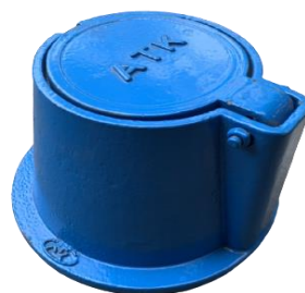
DUCTILE IRON BOX