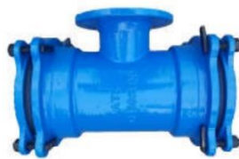
TEE EBE (FFB)