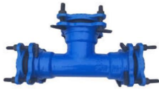
TEE EEE (FFF)